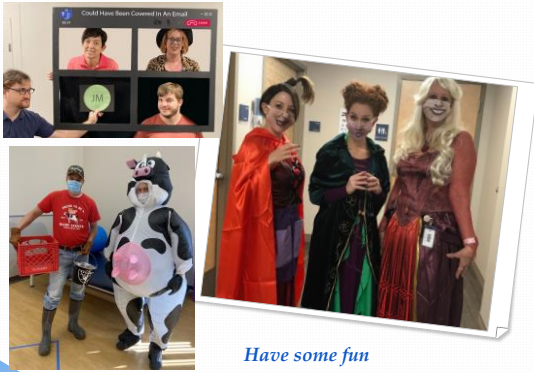
Have some fun