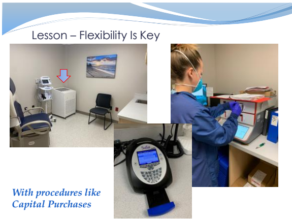
Lesson – Flexibility Is Key