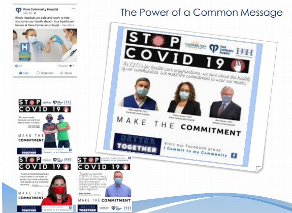
The Power of a Common Message