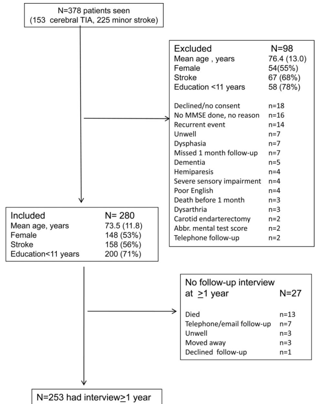
Figure 1. Flow chart showing the numbers and demographics of cerebral transient ischemic attack (TIA) and minor stroke patients included in the study and the reasons for noninclusion of excluded patients.

TCI was defined as a baseline MMSE score \geq 2 points lower than the 1-month follow-up MMSE (Supplemental Methods, http://stroke.ahajournals.org ) because published data on MMSE in normal elderly show only increases of < 1 point between first and repeat test scores (range mean 0.60–0.83 points in subjects of mean age 65 and 85 years, respectively), with smaller changes on subsequent retest. 11,12 However, analyses were repeated using baseline MMSE \geq 3 points lower than baseline score to ensure that results obtained using changes of \geq 2 points were not caused by small chance variation in MMSE scores. The \chi^2 test was used to test for differences in TCI rates between groups. Characteristics of patients with TCI were compared with those without TCI using Fisher exact test or Student t test as appropriate, and significance levels for OR were calculated using \chi^2 test. In determining longer-term cognitive outcomes, results were censored at the time of last cognitive assessment with follow-up time of 1 to 5 years. Severe dementia was defined as dementia of an advanced stage in which testing was felt to be clinically inappropriate or would cause distress to the patient or caregiver. Patients with