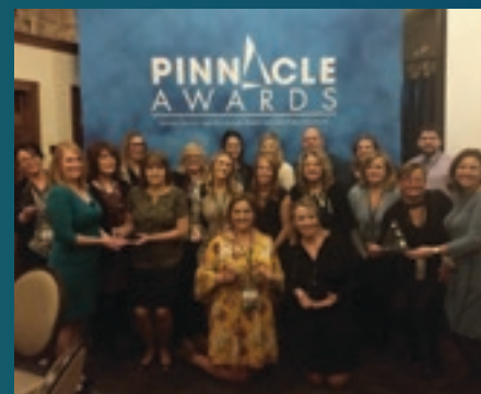
Several ICAHN member hospital marketers were recognized for their marketing campaigns during ISHMPP's annual awards conference.