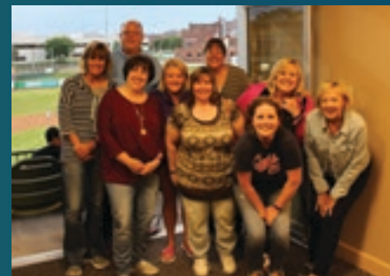
ICAHN staff celebrated a successful fitness challenge with some camaraderie at the Peoria Chiefs game.