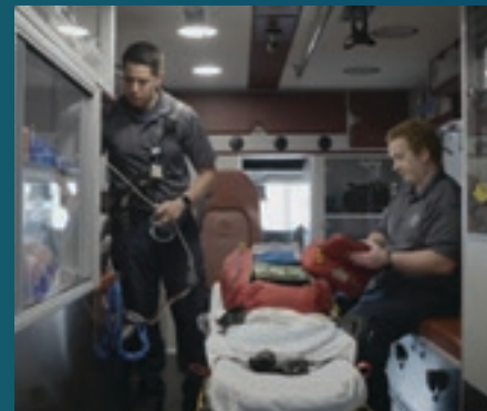
A Kirby Medical Center EMS recruitment video, filmed in Monticello, IL was created and distributed to rural EMS departments to encourage local recruitment efforts.